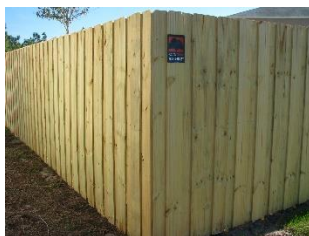
Board on Board

WARNING: Pre-manufactured sections may not comply with this code. Product approval may be required.